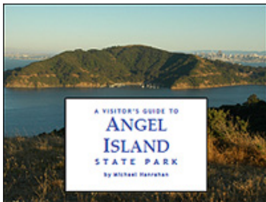
A Visitor's Guide to Angel Island State Park

Take a trip to visit the historical sites and scenic attractions of the largest island in San Francisco Bay. Angel Island is a world away from the city, with spectacular vistas, hiking, biking, camping, boating and kayaking.